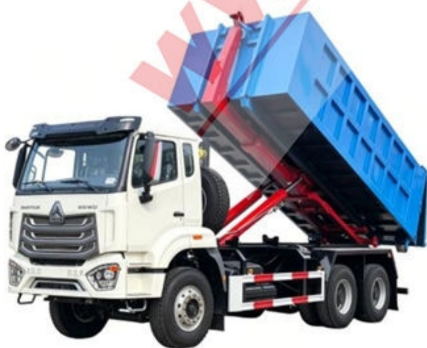
Model 1 as Dump Truck