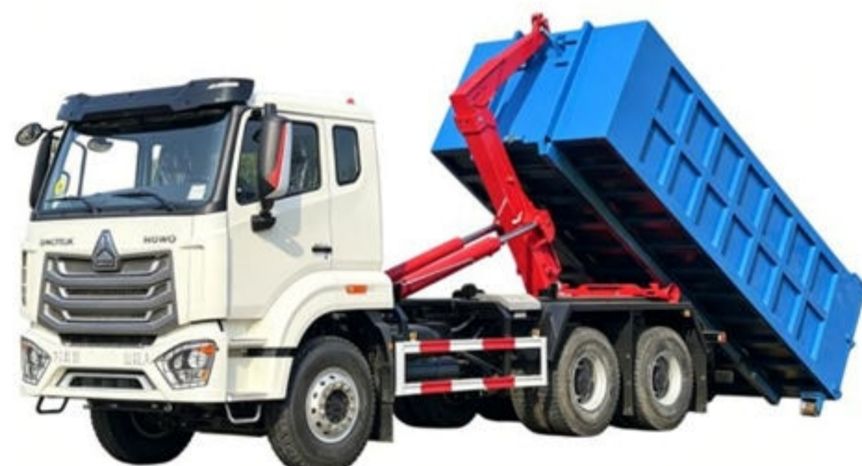
Model 2 to Discharge Garbage Bins

5. 24 hours technical support: 0086 155 7227 0555